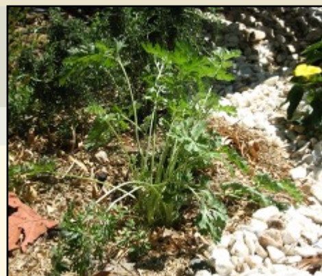
Wormwood Plant – Morning shade, about three hours of afternoon sun.

To protect your tender plants from hungry caterpillars, propagate and grow an herb called wormwood throughout your garden and landscaping areas. It will withstand the heat of summer if it is in partial shade. If the herb doesn't completely detour caterpillars by just growing near your plants, you can also take a nice harvest of wormwood (about two cups of the leaves and stems) and make a nice anti-caterpillar spray. Steep wormwood stems and leaves in about three cups of water for 30 minutes. I always cover the sauce pan to keep every drop! Then strain the liquid through a coffee filter into a quart size glass canning jar. Add two tablespoons of Murphy's oil soap and an additional cup of water. Add 1 Tbsp of this solution per 16 oz of water (usually a spray bottle) or you can put the mixture in a hose end sprayer and dowse your plants with it. The whole quart of solution will make 6 gallons of treatment. This also works for lawn grubs! Just take care to either spray the leaves in the early evening after heat of sun has passed or early morning before the sun hits the leaves. If you treat in the morning, you will need to rinse off the treatment after about 30 minutes; the soap may cause the sun to burn tender leaves. I usually purchase my open pollinated wormwood seeds online at www.seedsofchange.com , www.territorialseed.com , www.johnnyseeds.com , or www.bountifulgardens.org .